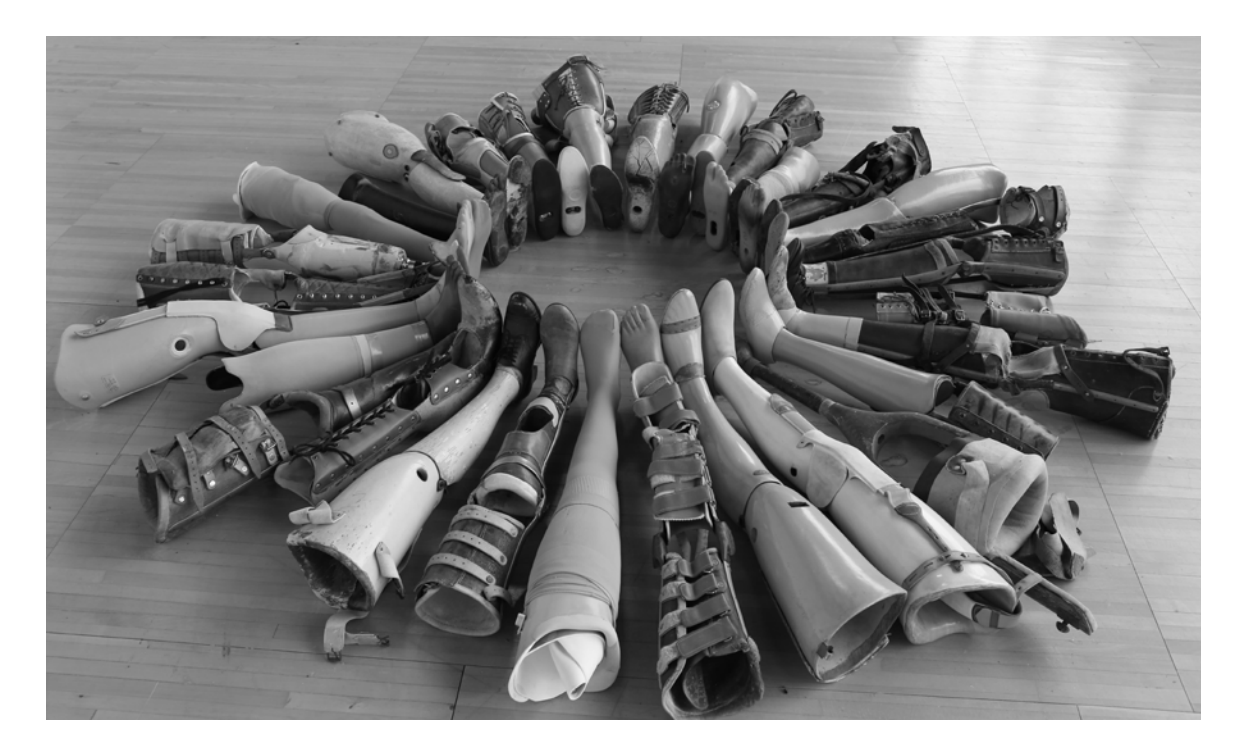
Did you forget to drop a bomb or a mine?

for the rehabilitation of the upper limb! There are around fifty worldwide, and this, of course, by different laboratories. In addition, if we look more closely at those that have been clinically or pre-clinically tested, there are no more than 8 to 10 in total. In fact, very often the device is only validated on healthy subjects but we rarely go on to the next stage". Funding policies should therefore take this validation step into account or allow improvements to already existing devices, especially in the medical field. Innovation is nothing if it is limited to proof of concept.