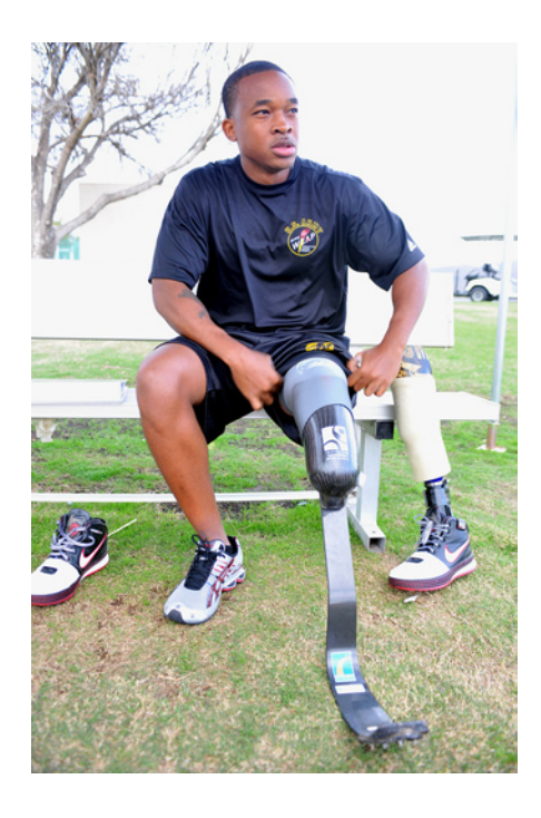
Setting sites on Gold in 2012

Oscar Pistorius is held up as an example, but what they forget to say is that, to keep his balance, he has to hop on the spot, and that if he wants to swim or simply walk, he must change prosthesis. All this is a significant constraint. It's a world away from the adaptability of a human lower limb. Some predict that soon we will be amputating a limb in order to gain in physical performance but what about the damage to the body map and the pain of the phantom limb? What about the unrivalled versatility of our bodies?